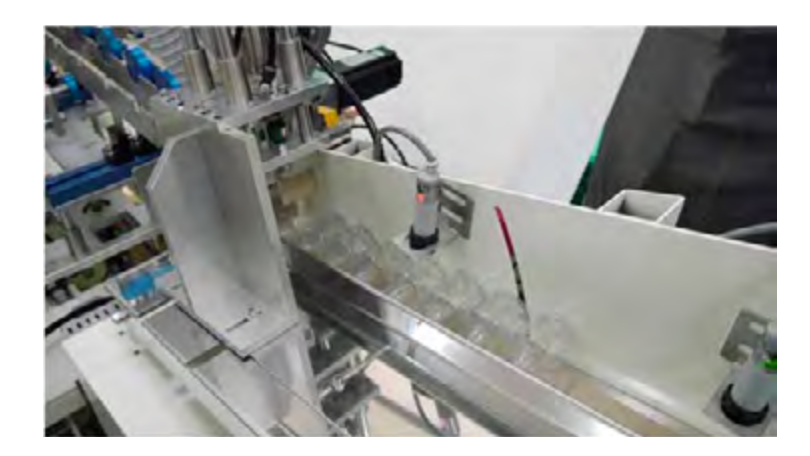
Feeding ramp mechanism