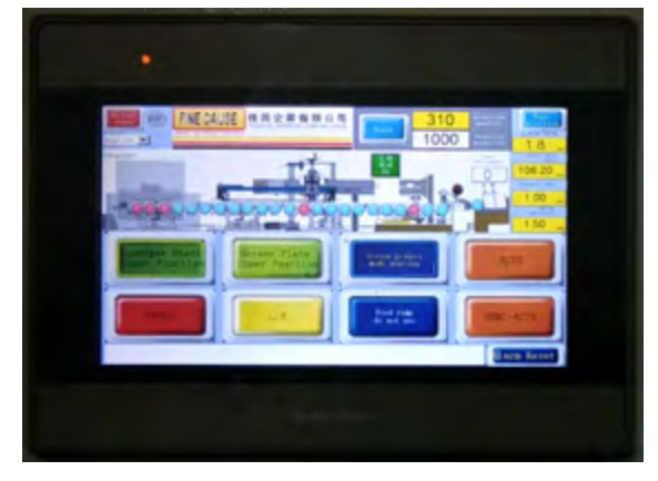
7 -inch color touch panel screen